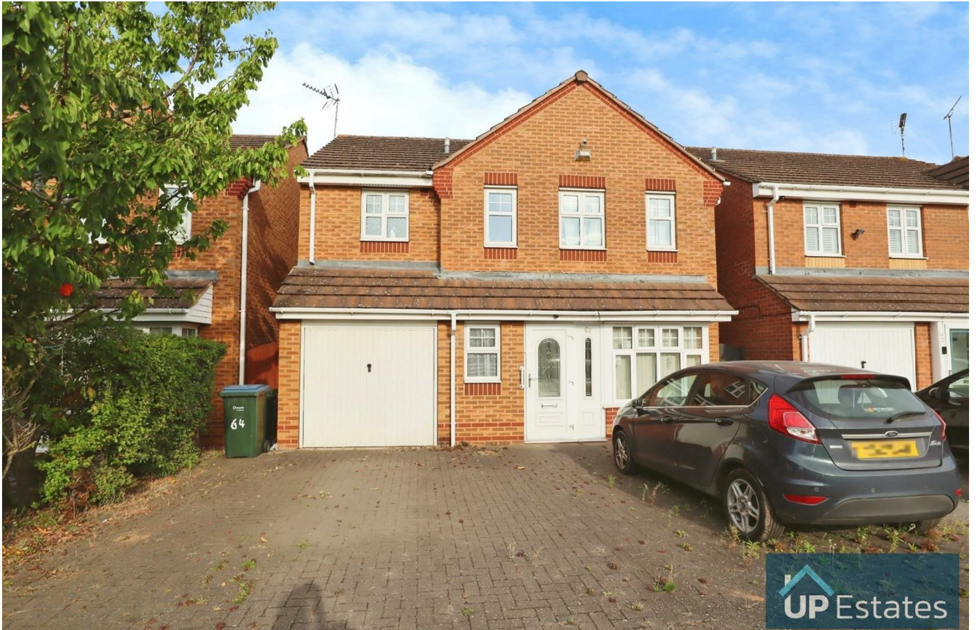
Chorley Way, Coventry