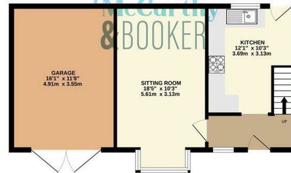
GROUND FLOOR 531 sq.ft. (49.3 sq.m.) approx.

TOTAL FLOOR AREA : 847 sq.ft. (78.7 sq.m.) approx.