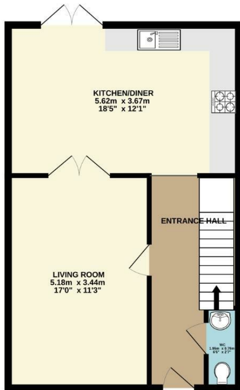
GROUND FLOOR 49.7 sq.m. (535 sq.ft.) approx.