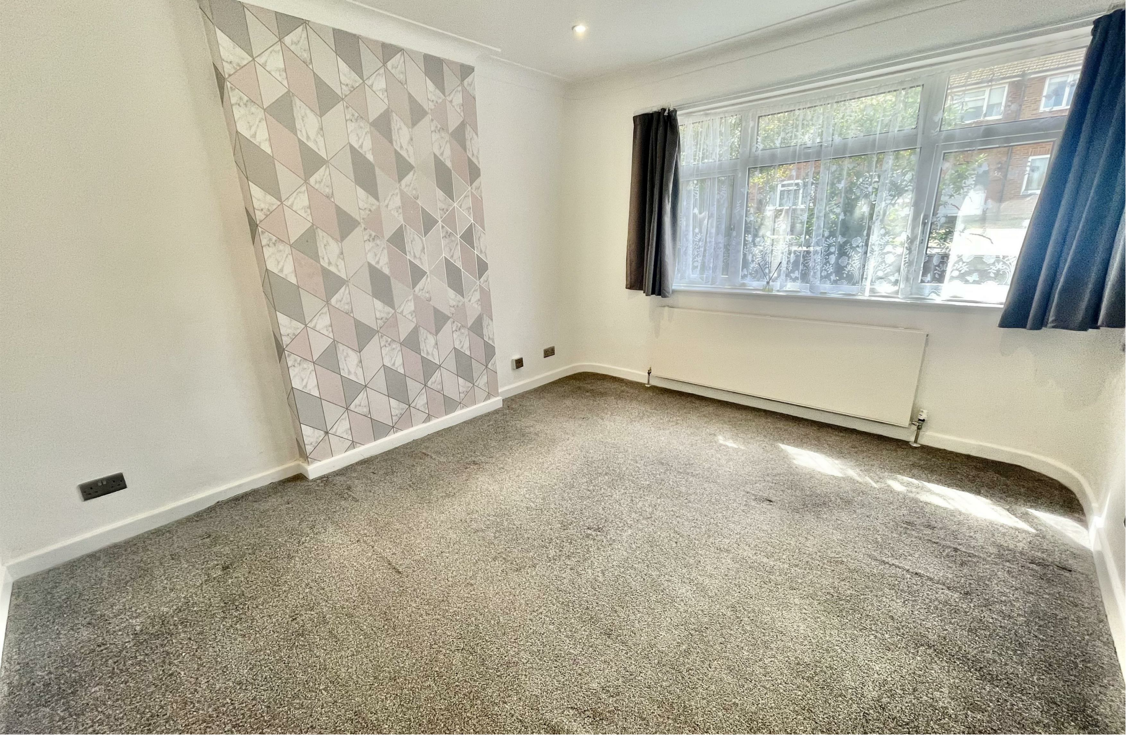
29 Sherwood Avenue, Potters Bar, EN6 2LD