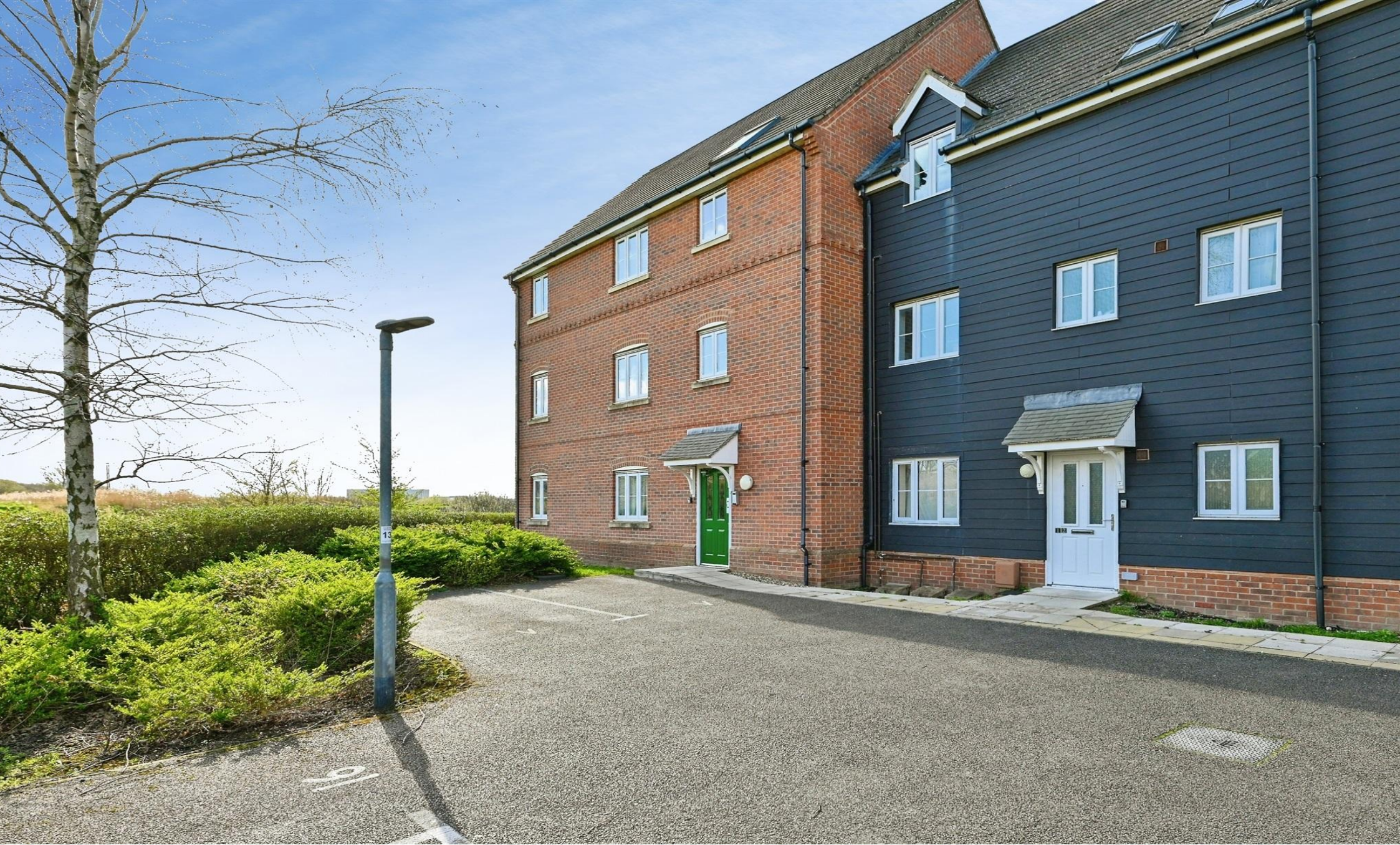
Dukes Place, King's Lynn, PE30 4GZ