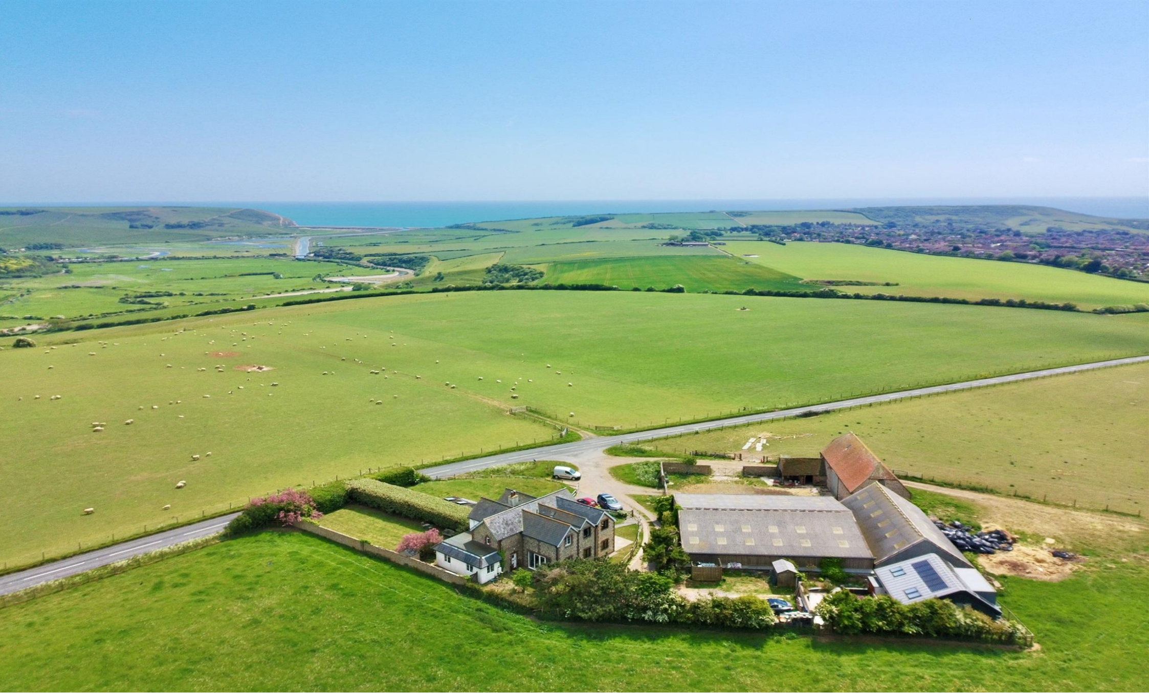
Seaford Cottage Alfriston Road, Seaford BN25 3AB