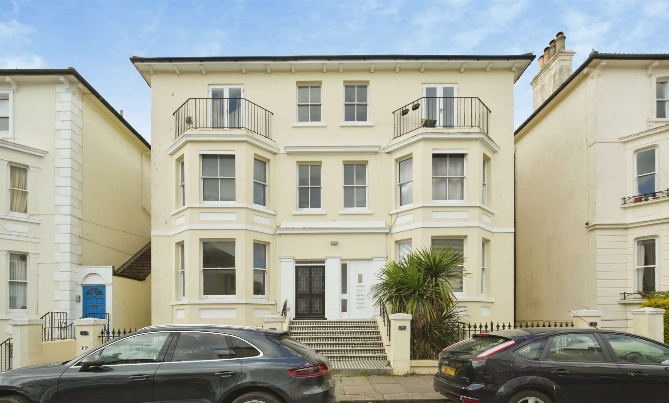
Hova Villas, Hove BN3 3DG