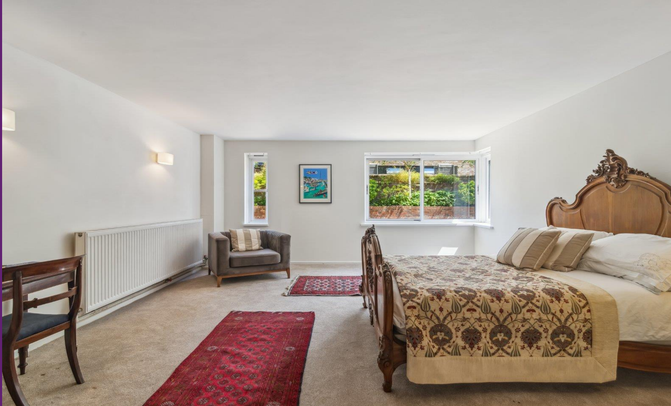
Kensington Place Kensington, W8