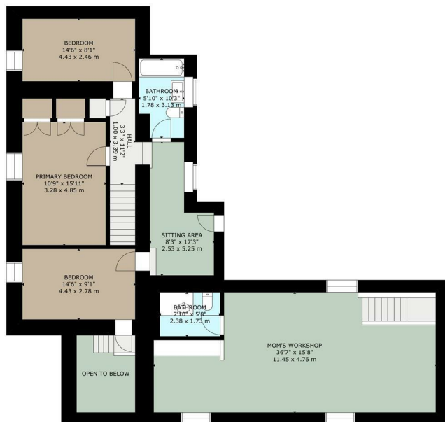
GROSS INTERNAL AREA TOTAL 311 m 2 /3,353 sq ft FLOOR 1: 173 m 2 /1,866 sq ft FLOOR 2: 138 m 2 /1,487 sq ft SIZE AND DIMENSIONS ARE APPROXIMATE, ACTUAL MAY VARY