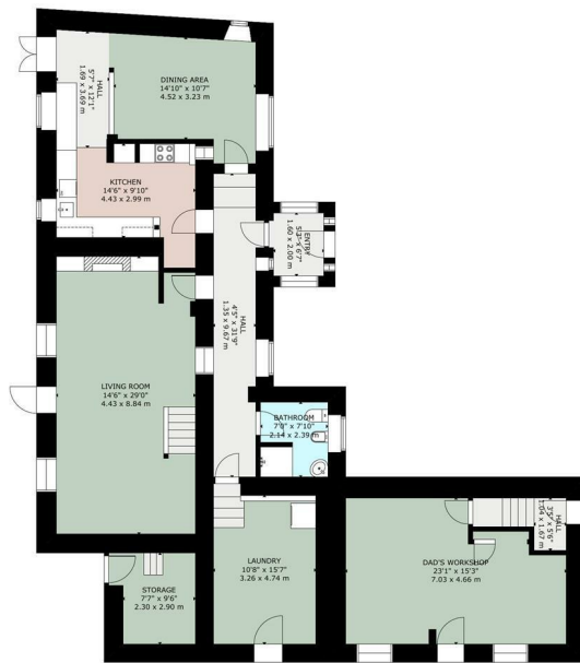
GROSS INTERNAL AREA TOTAL 311 m 2 /3,353 sq ft FLOOR 1: 173 m 2 /1,866 sq ft FLOOR 2: 138 m 2 /1,487 sq ft SIZE AND DIMENSIONS ARE APPROXIMATE, ACTUAL MAY VARY