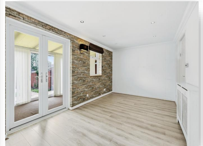
Walledwell Court, Northampton NN3 9TW