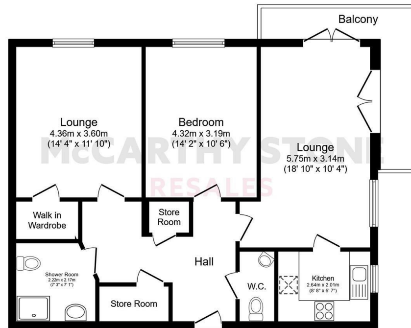
Total floor area 79.6 m 2 (857 sq.ft.) approx This floor plan is for illustrative purposes only. It is not drawn to scale. Any measurements, floor areas (including any total floor area), openings and orientation are approximate. No details are guaranteed, they cannot be relied upon for any purpose and they do not form part of any agreement. No liability is taken for any error, omission or misstatement. A party must rely upon its own inspection(s). Powered by www.localagent.com