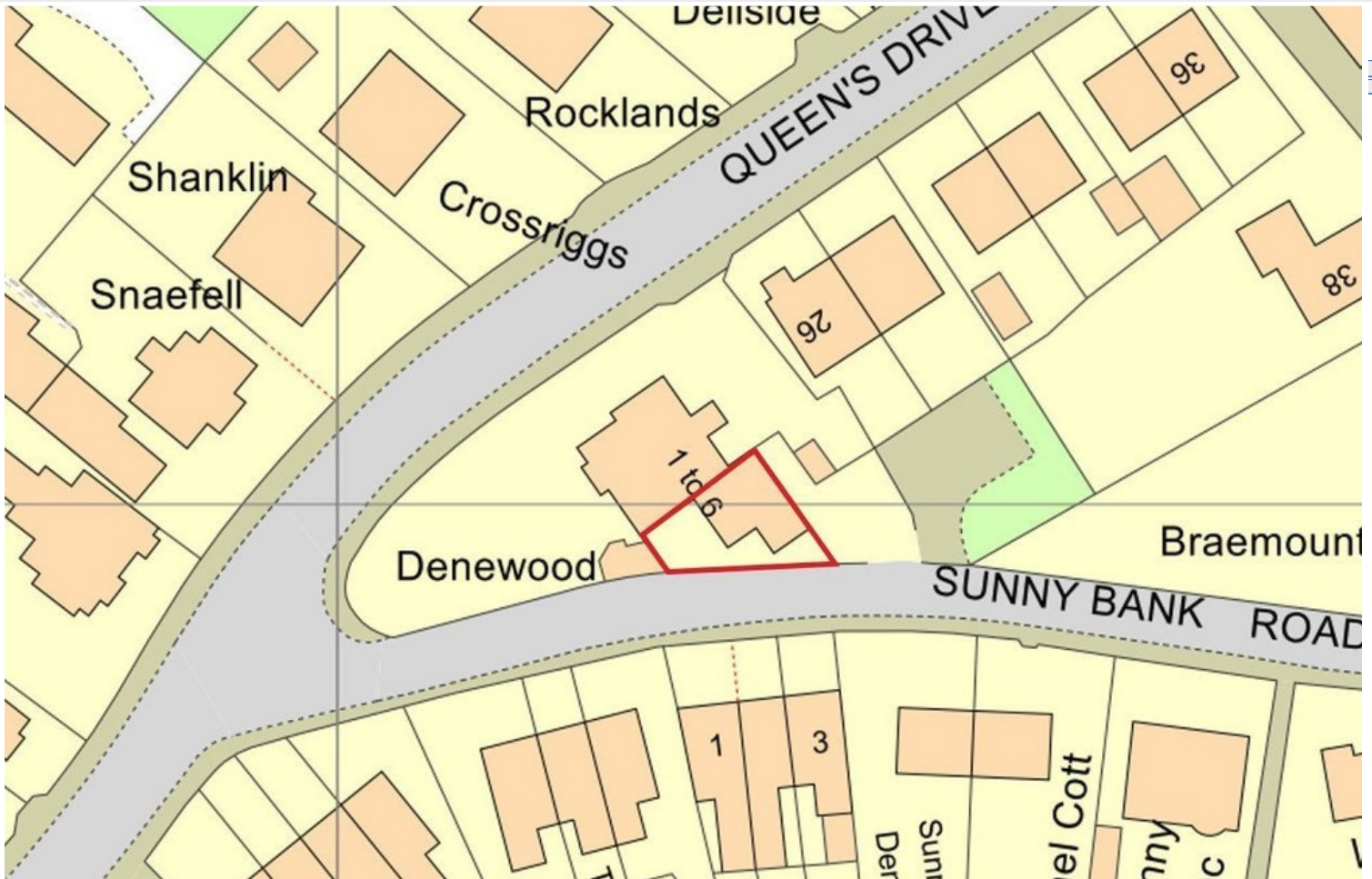
Ordnance Survey Map

Request a Viewing Online or Call 015394 44461