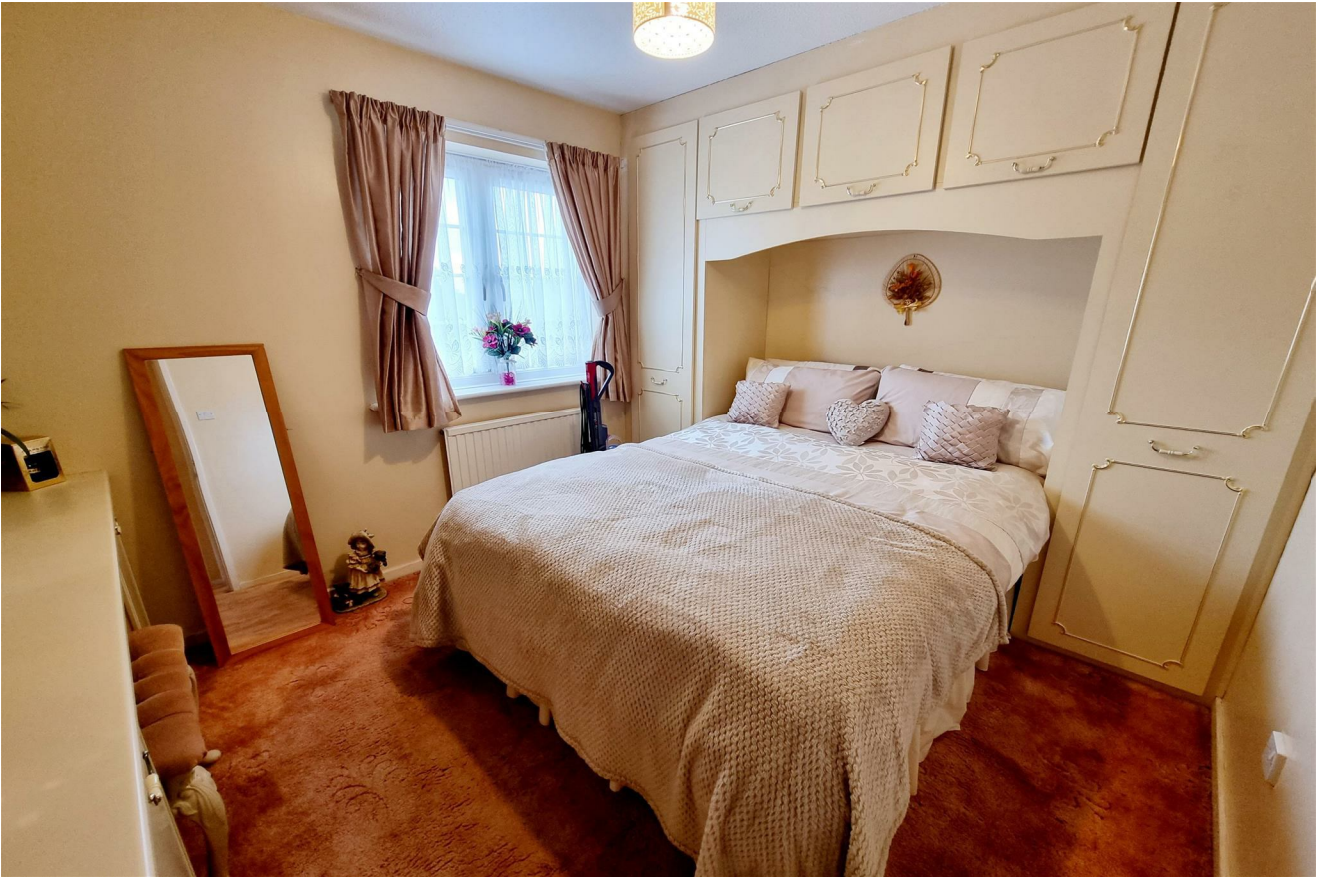
BEDROOM 3 10' x 6'3 (3.05m x 1.91m) Double Glazed Window to Front, Radiator, Fitted Cupboard.