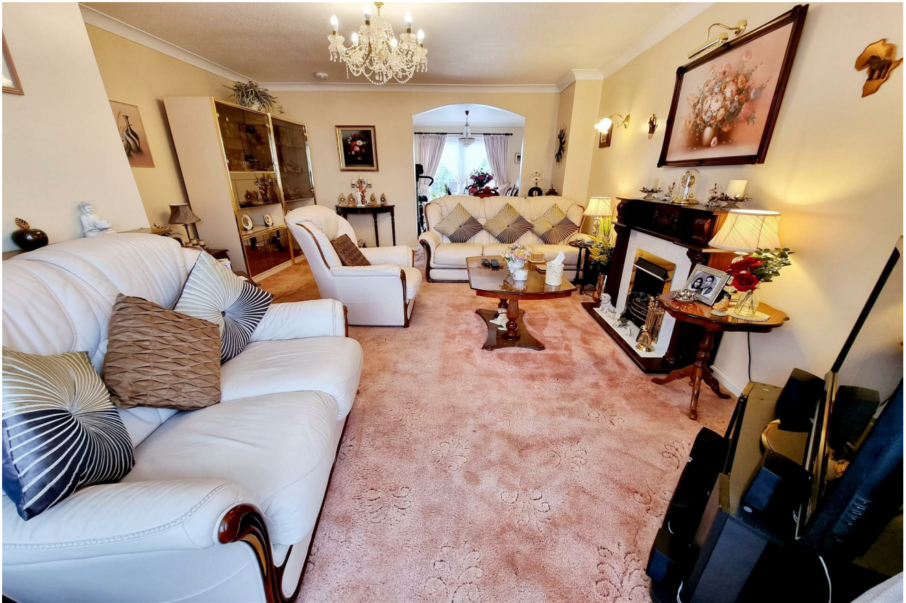
FRONT RECEPTION AREA (pic 2)

Double Glazed Square Bay Window to Front, Adam Style Fireplace, Radiator.