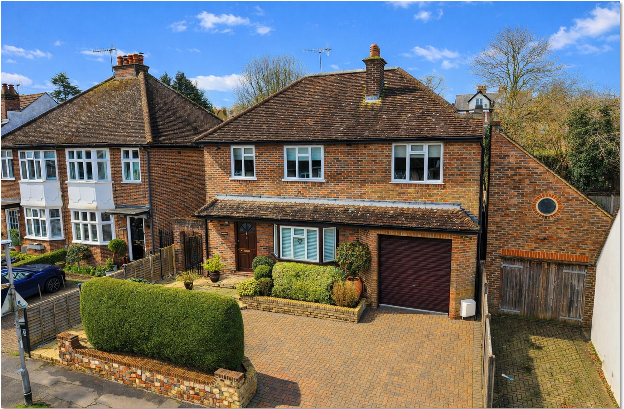
West Road, Berkhamsted HP4 3HT