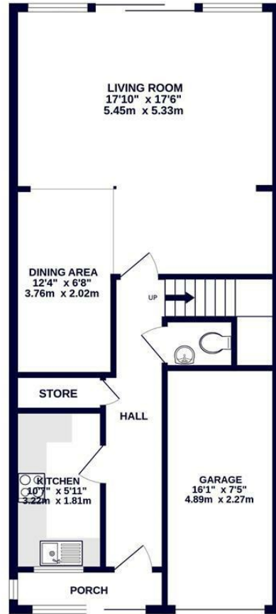
GROUND FLOOR 698 sq.ft. (64.8 sq.m.) approx.