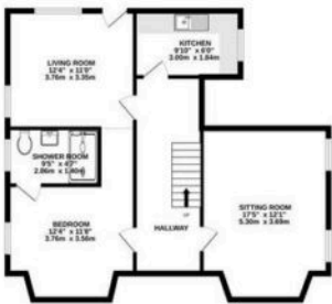
BASEMENT 797 sq.ft. (74.0 sq.m.) approx.