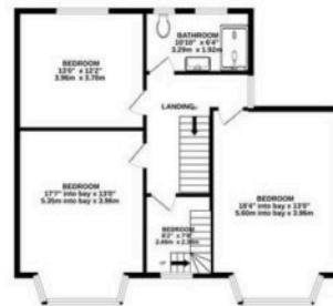
1ST FLOOR 836 sq.ft. (77.7 sq.m.) approx.