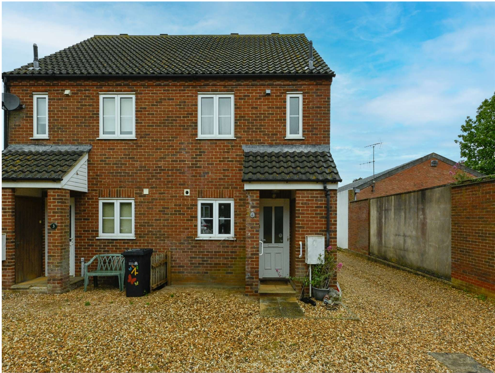
George Raines Close, Hunstanton, PE36 5BJ