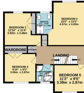
1ST FLOOR 787 sq.ft. (73.1 sq.m.) approx.