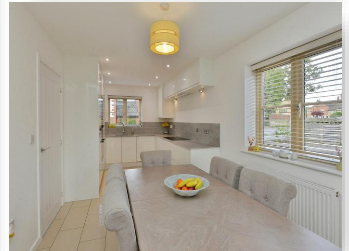
High Street, Deanshanger Milton Keynes MK19 6HD