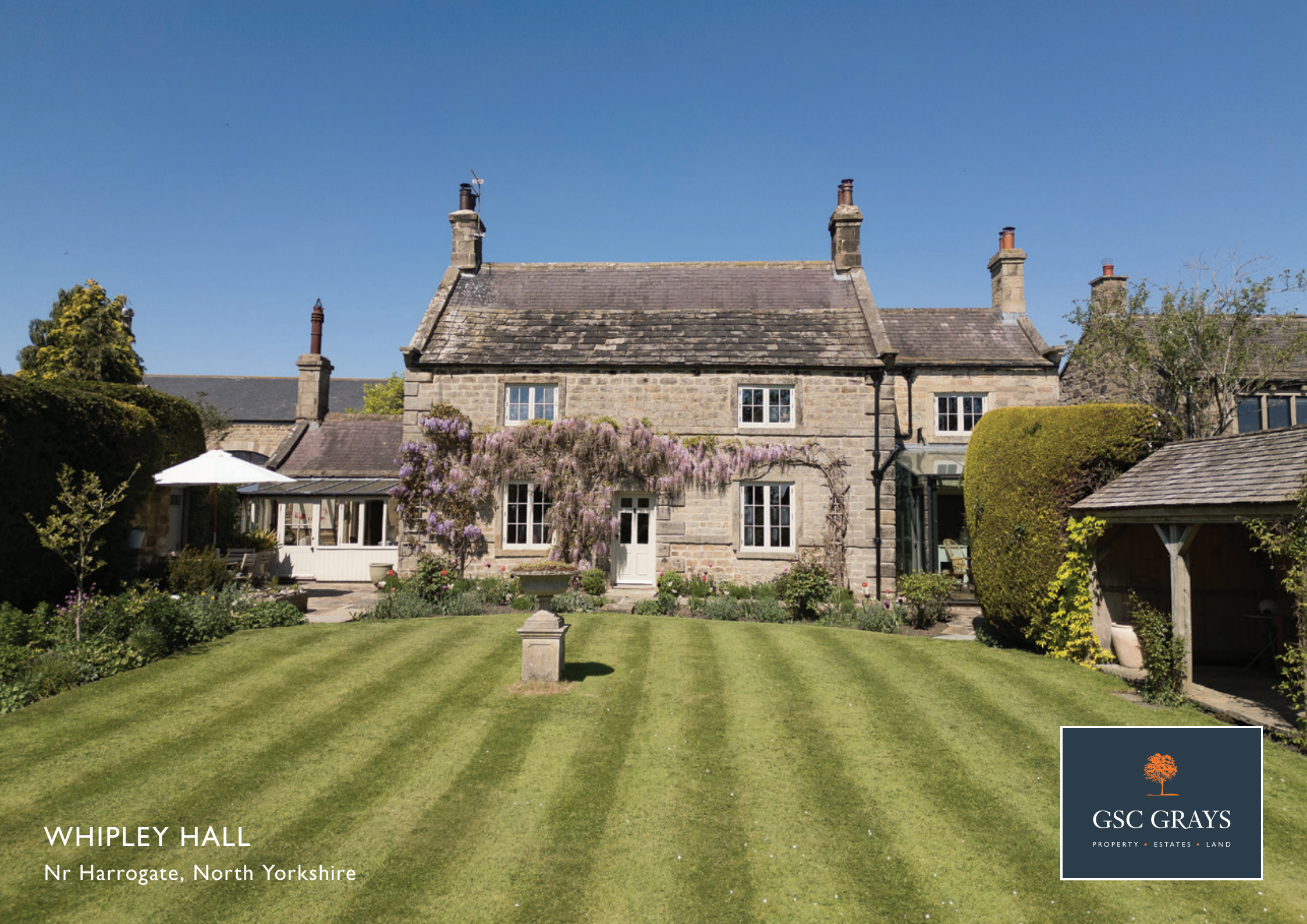
WHIPLEY HALL Nr Harrogate, North Yorkshire