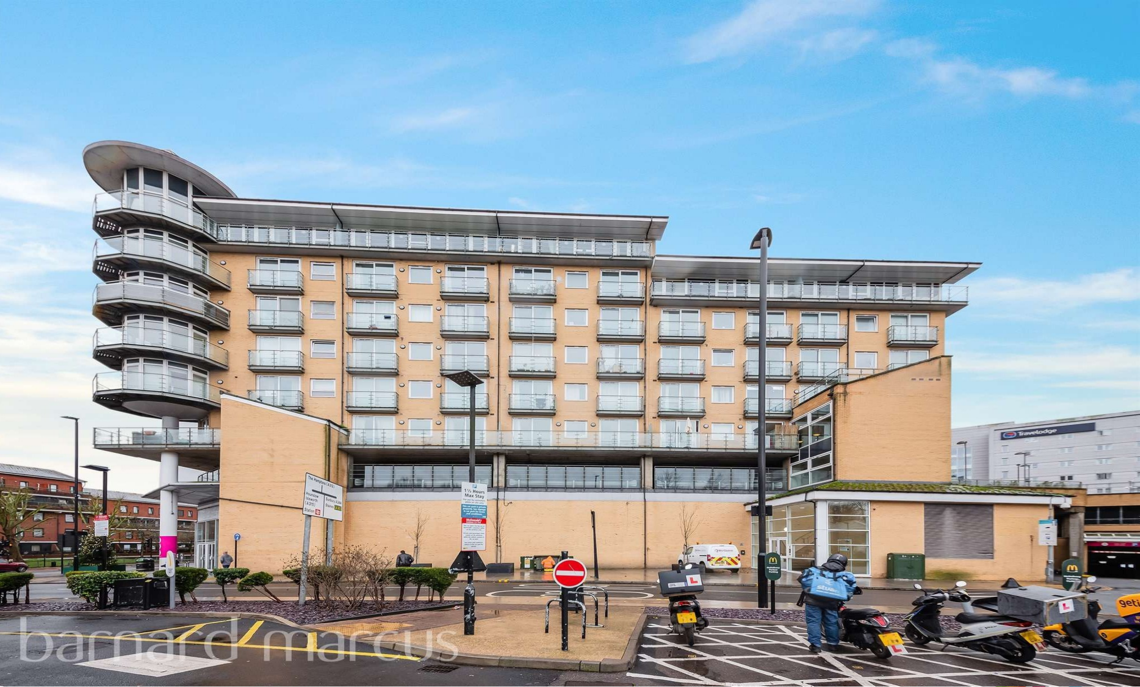
Azalea House Bedfont Lane, Feltham TW13 4GB