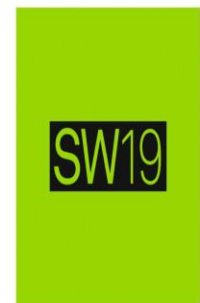
ILLUSTRATION FOR IDENTIFICATION PURPOSES ONLY

ALL MEASUREMENTS ARE MAXIMUM, AND INCLUDE WINDOW BAYS AND WARDROBES WHERE APPLICABLE THIS PLAN MUST NOT BE REPRODUCED BY ANY OTHER PERSON WITHOUT PERMISSION