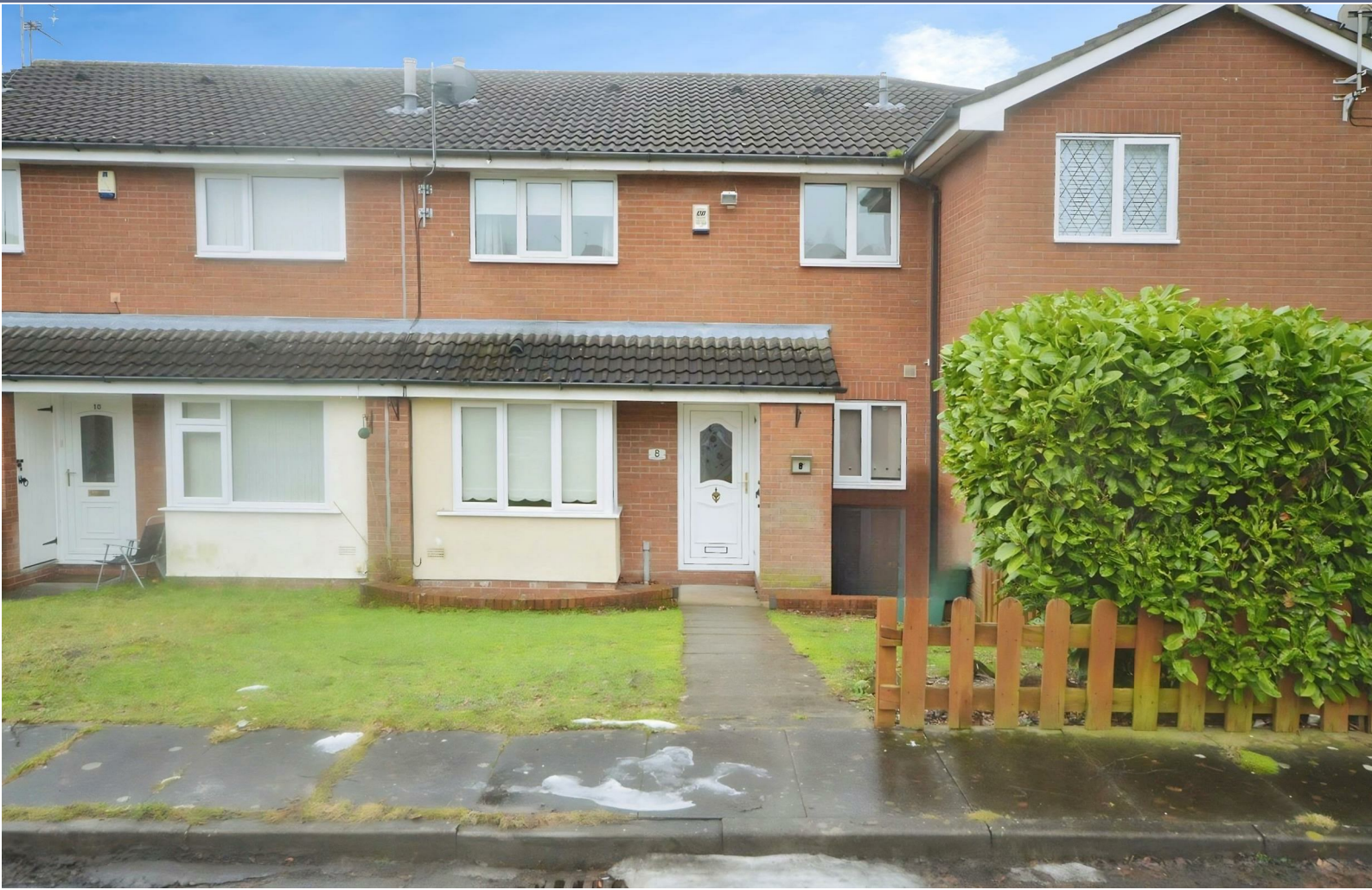
Haslington Close Waterhayes