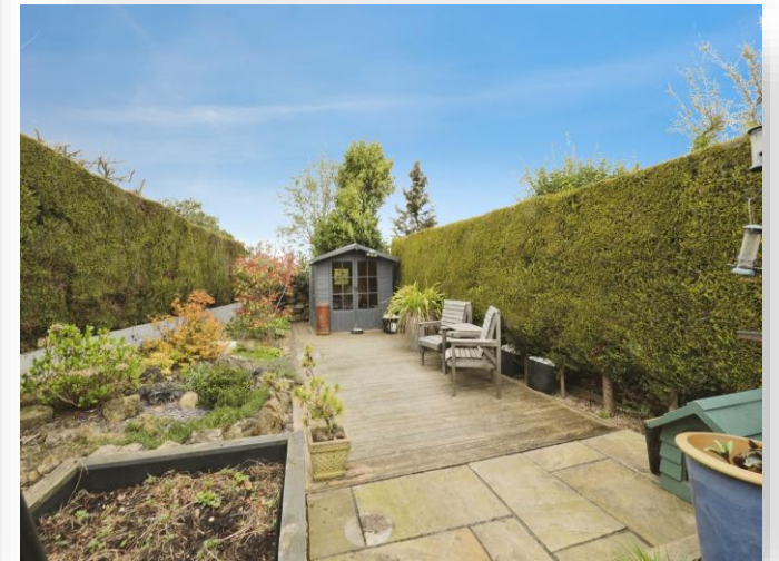
Timble Grove, Harrogate HG1 2BJ