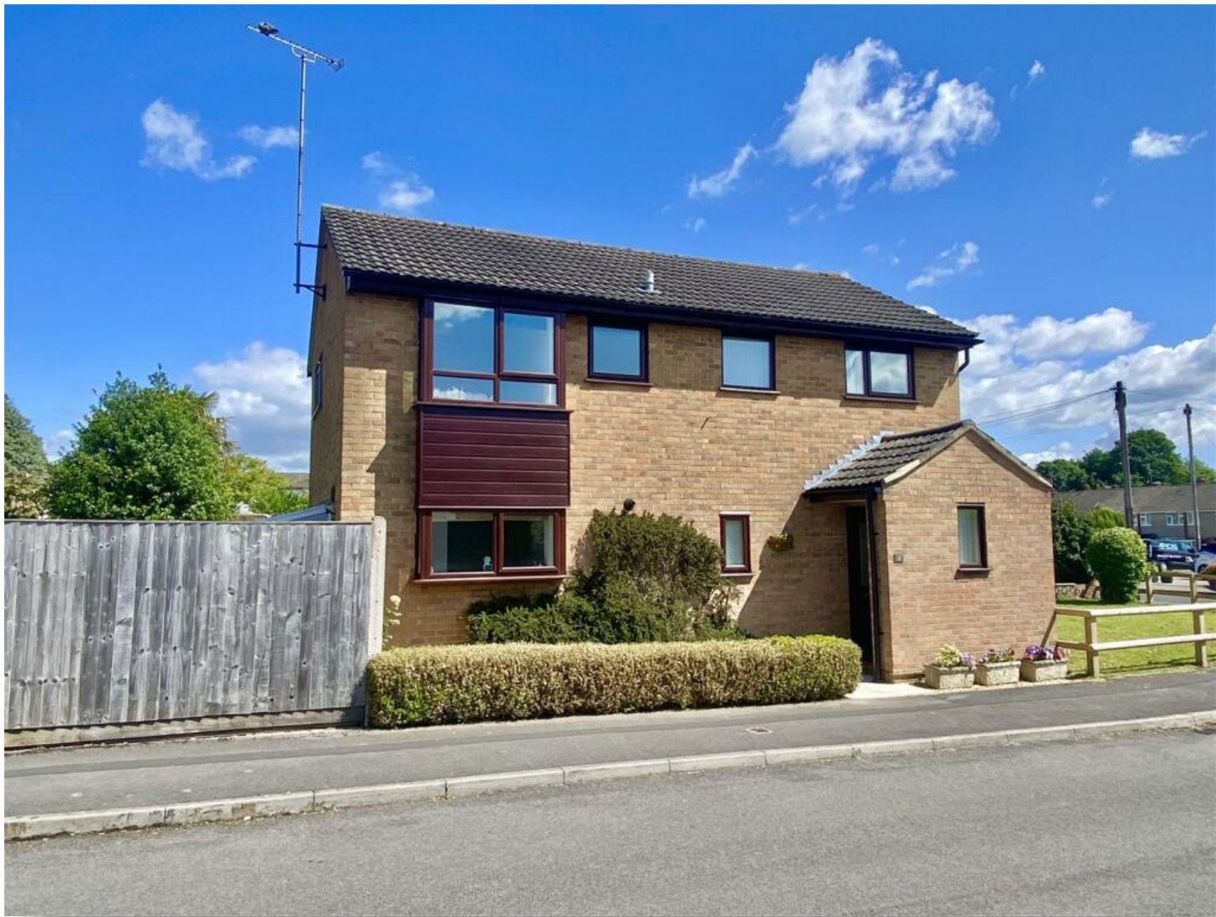
Andrews Close, Chippenham, SN14 0TX