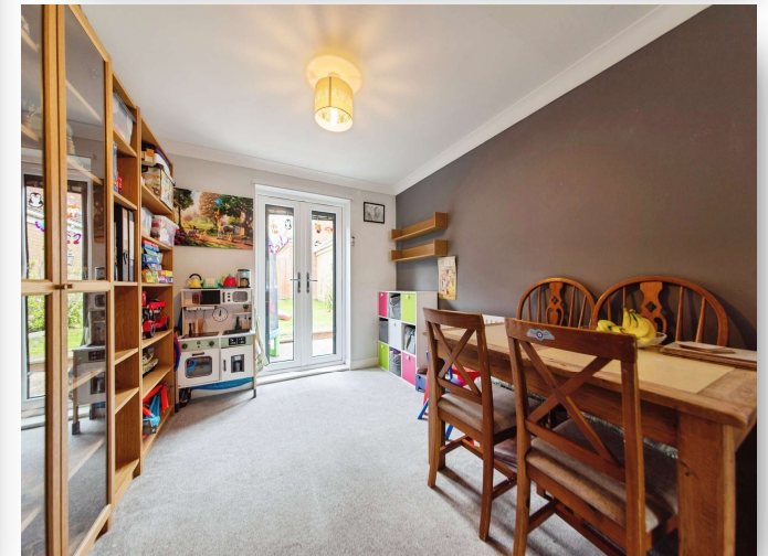
Shire Close, Billingham Lincoln LN4 4GR