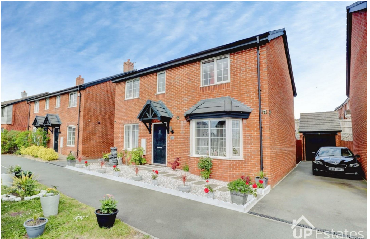
Skelhorn Avenue, Rocheberie Heights, Rugby