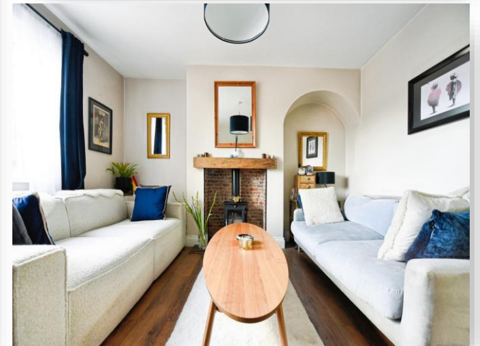
Eastview Terrace, Highworth Swindon SN6 7HH