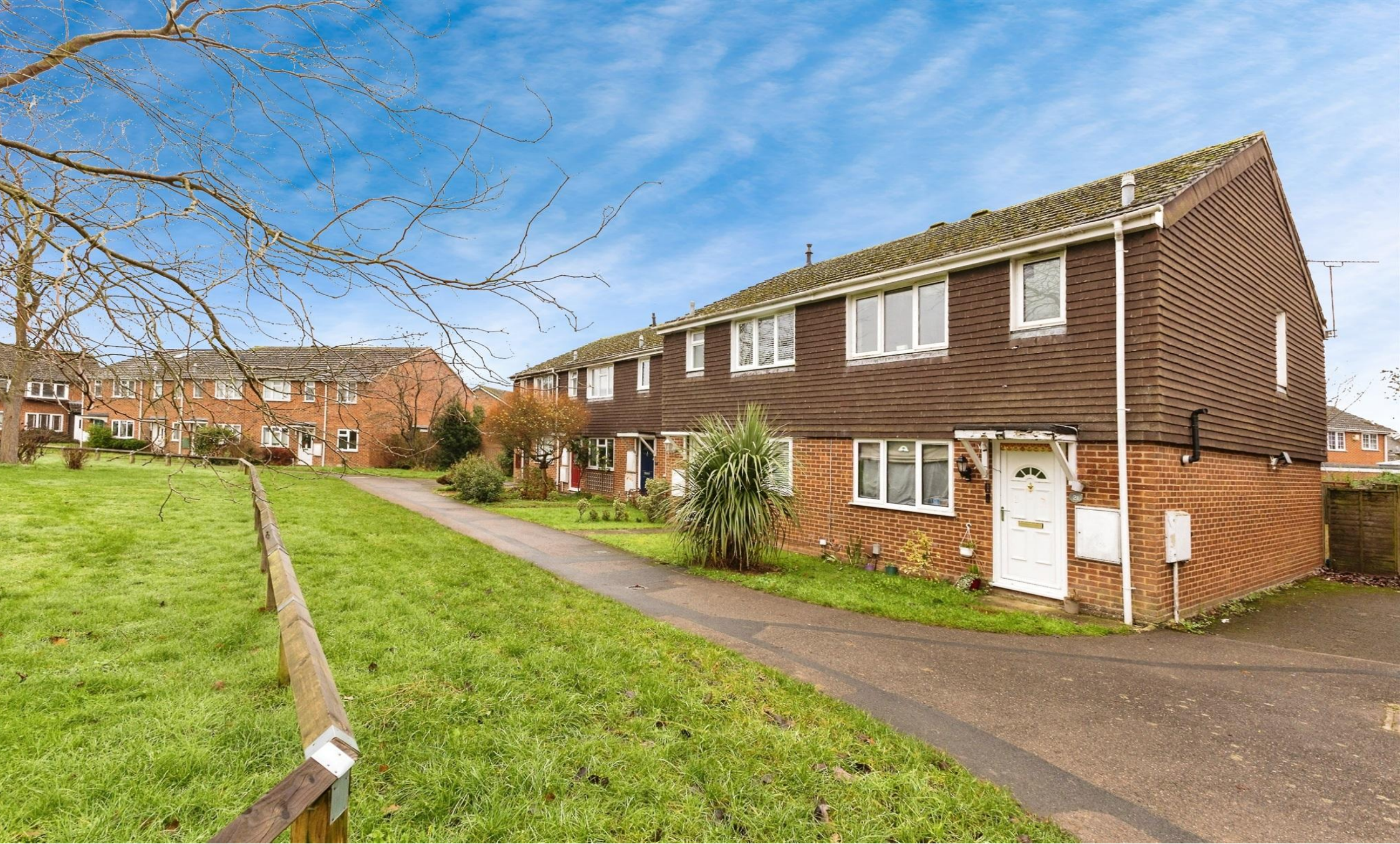
Felixstowe Close, Lower Earley READING RG6 3UF