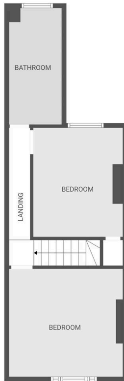
FLOOR PLAN CREATED BY CUBICASA APP. MEASUREMENTS DEEMED HIGHLY RELIABLE BUT NOT GUARANTEED.