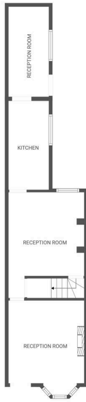
FLOOR PLAN CREATED BY CUBICASA APP. MEASUREMENTS DEEMED HIGHLY RELIABLE BUT NOT GUARANTEED.