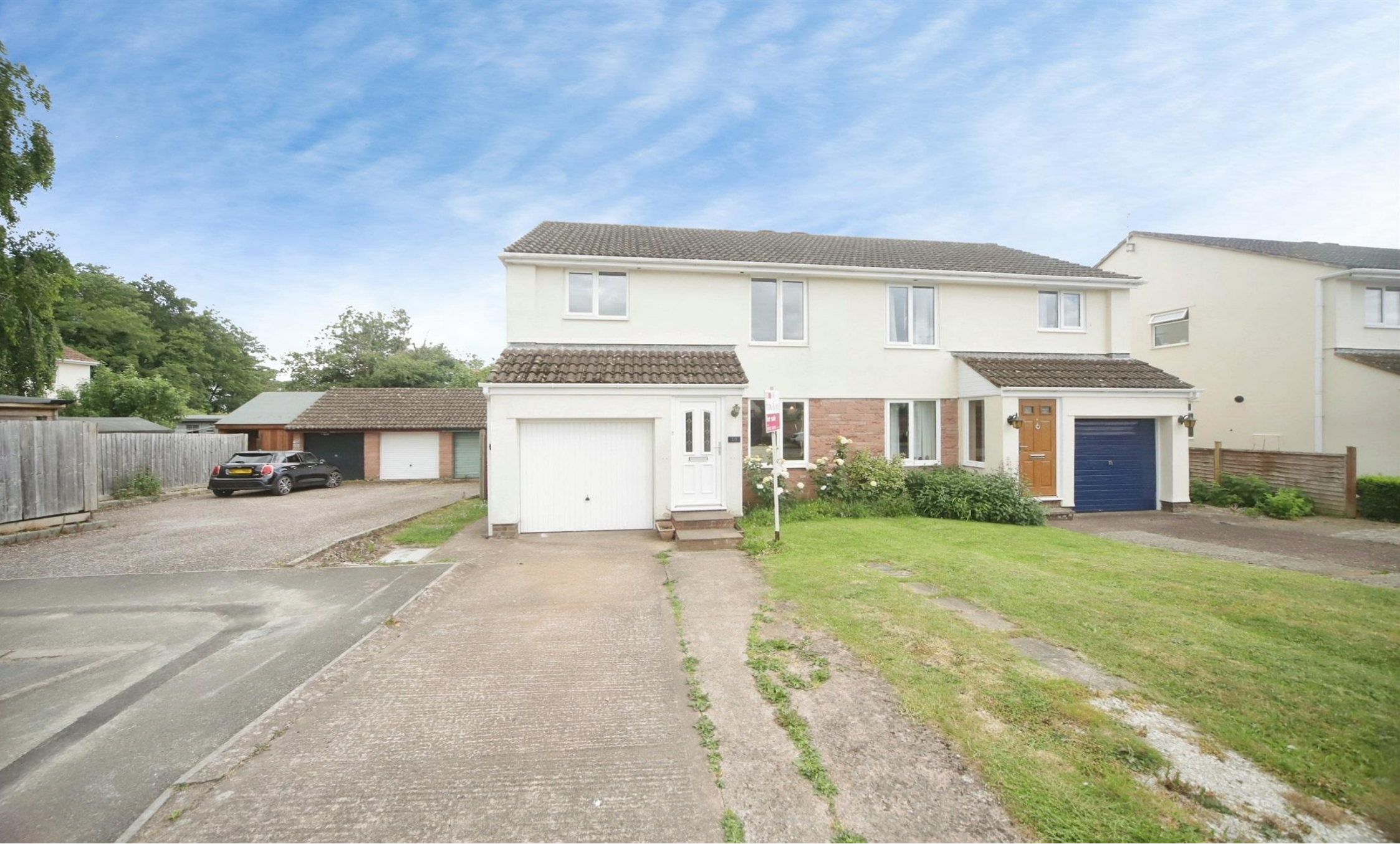
Spinneyfield, Bishops Lydeard Taunton TA4 3PD