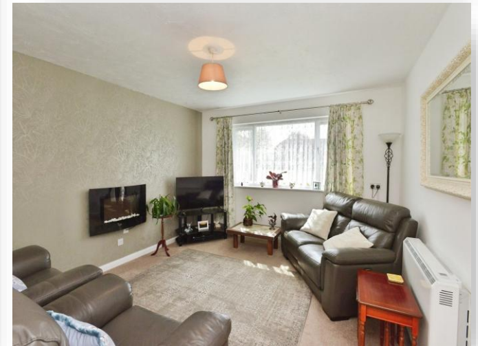
Ruskin Court, Newport Pagnell, MK16 0JL