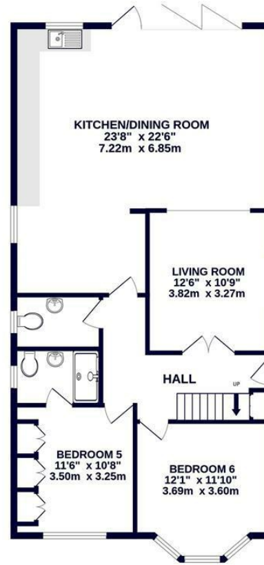
GROUND FLOOR 1021 sq.ft. (94.9 sq.m.) approx.