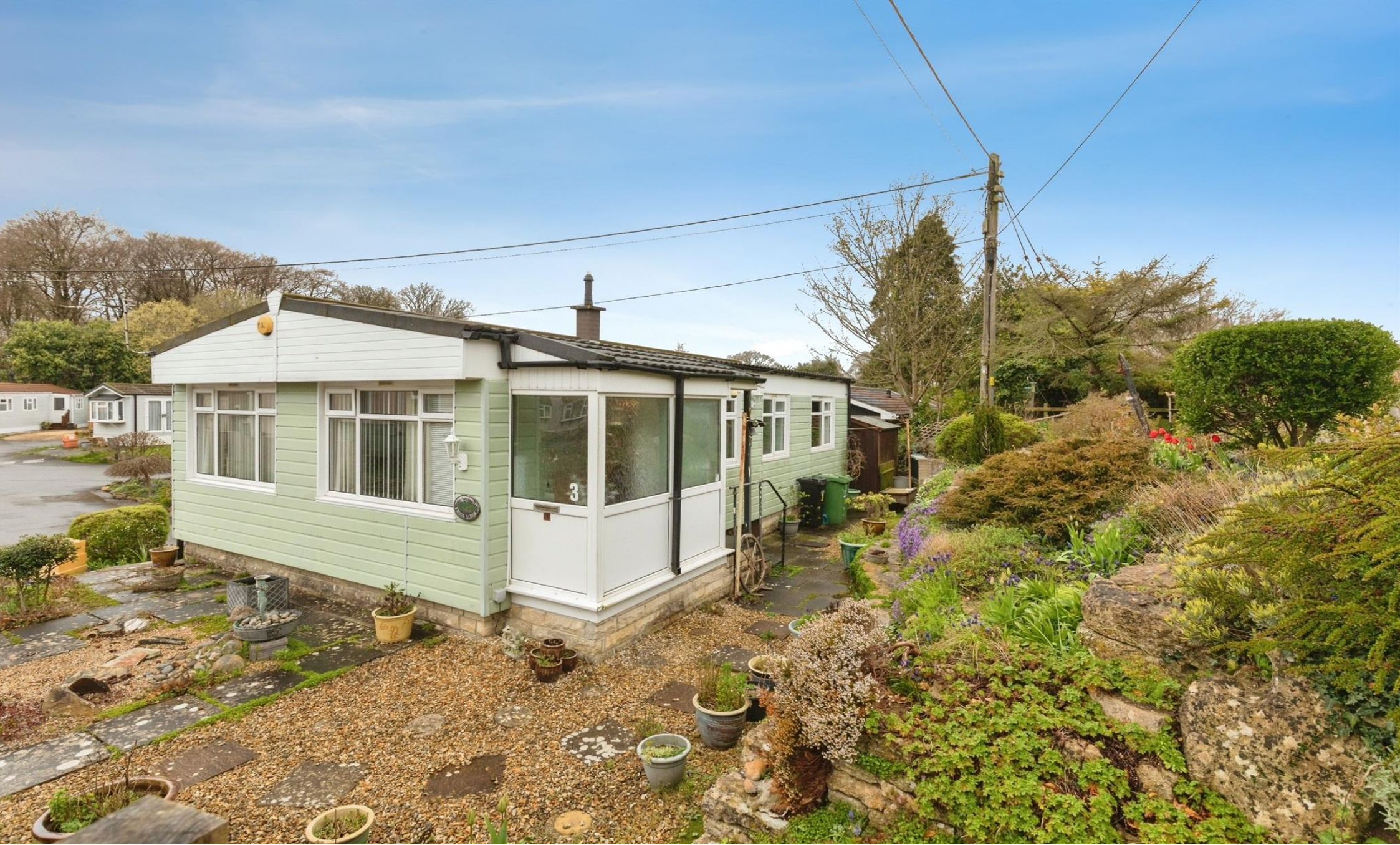
Quarry Rock Gardens, Bath BA2 6EF