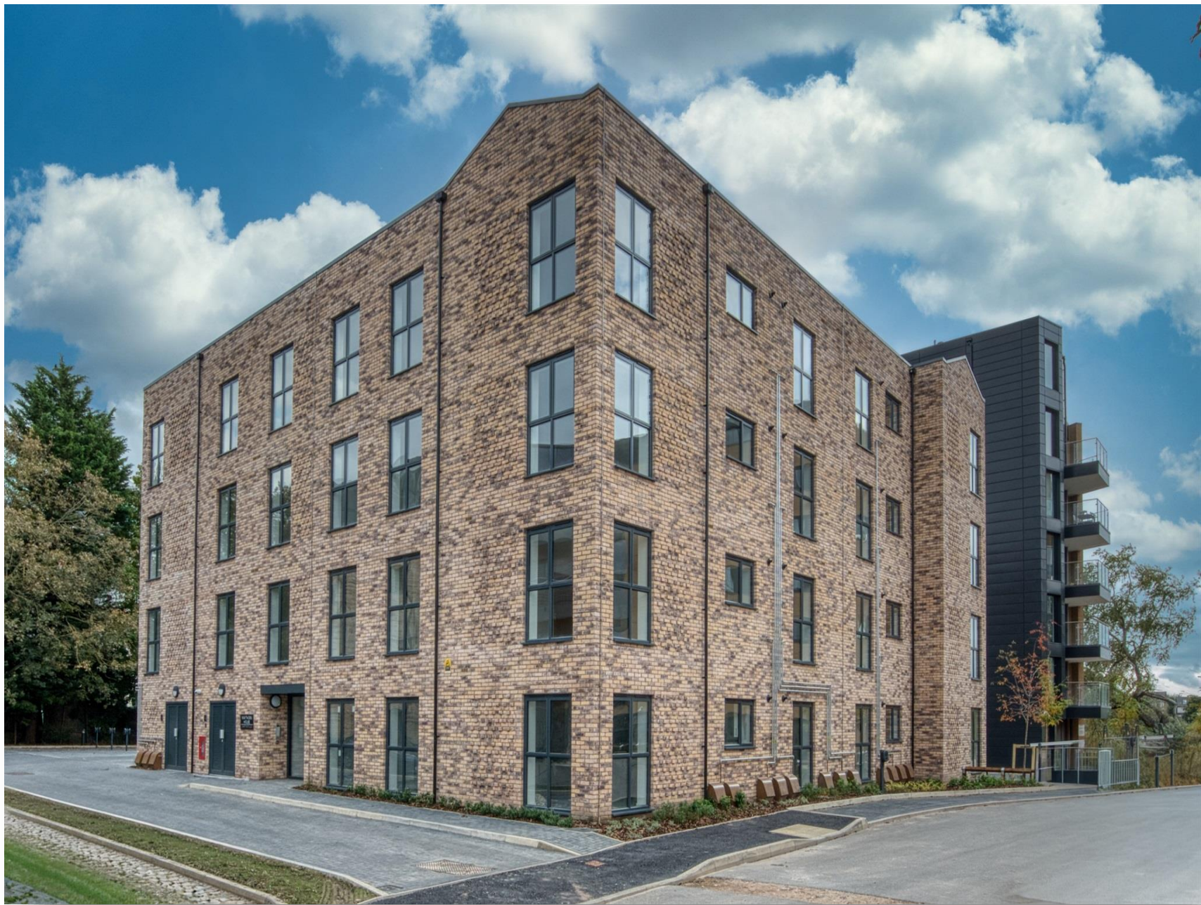
Maythorn House Trent Lane, Nottingham NG2 4DS