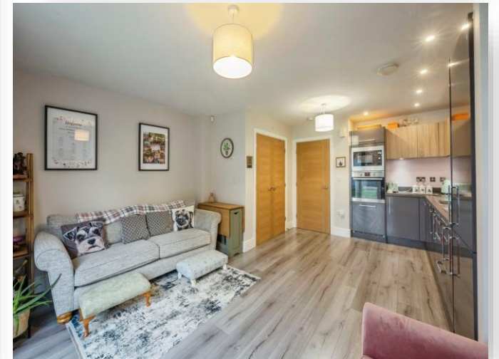
Wild Geese Way, MEXBOROUGH S64 0FB