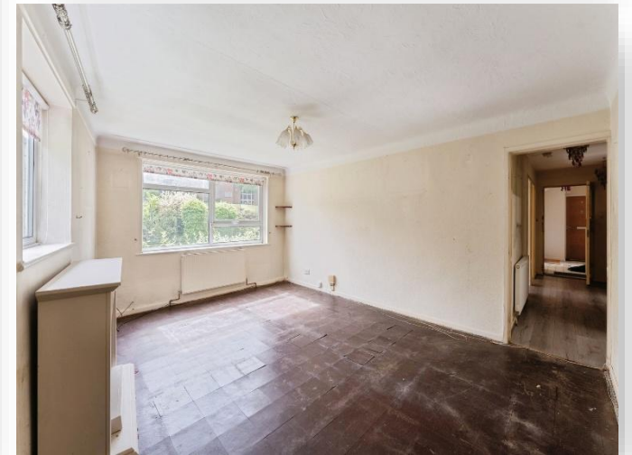
St. Stephens Court, Prenton Lane, Birkenhead, CH42 8QD