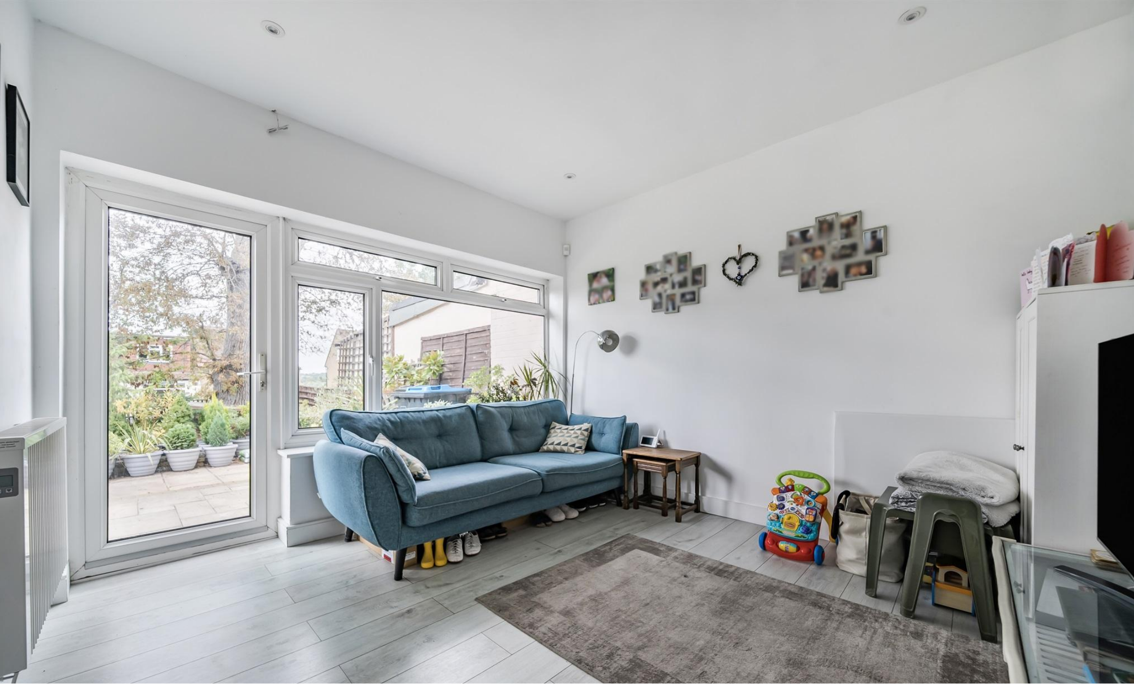
The Glade, Enfield, EN2 7QH