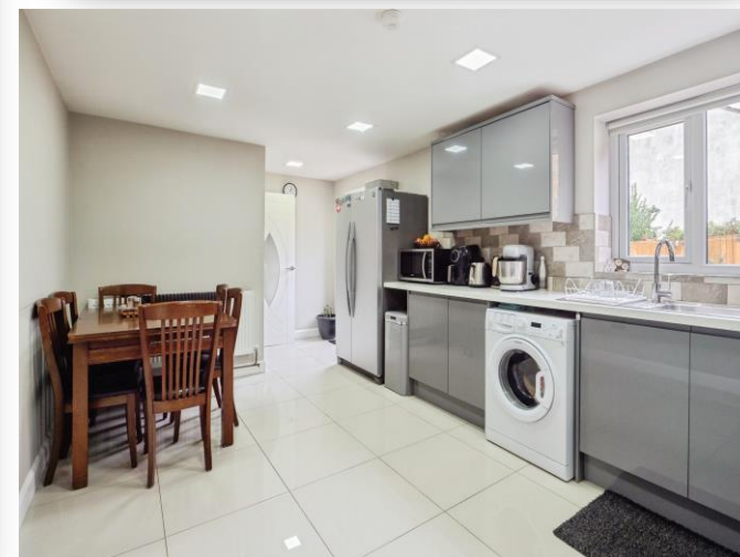
Kirkwall Crescent, Leicester LE5 2QB