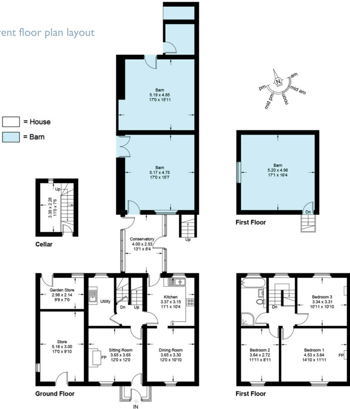
Illustration for identification purposes only, measurements are approximate, not to scale. (ID1226435)