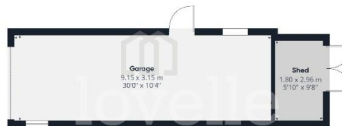
Floor 0 Building 3

Approximate total area (1) 109.1 m 2 1173 ft 2