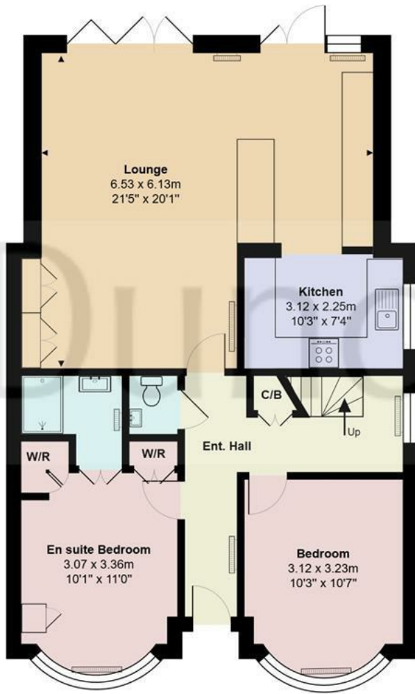
Ground Floor Area: 84.7 m 2 ... 911 ft 2