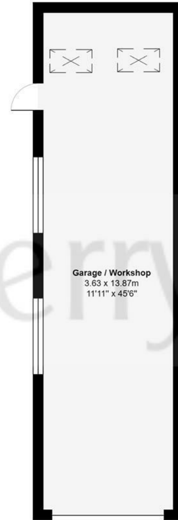
Not shown in actual location