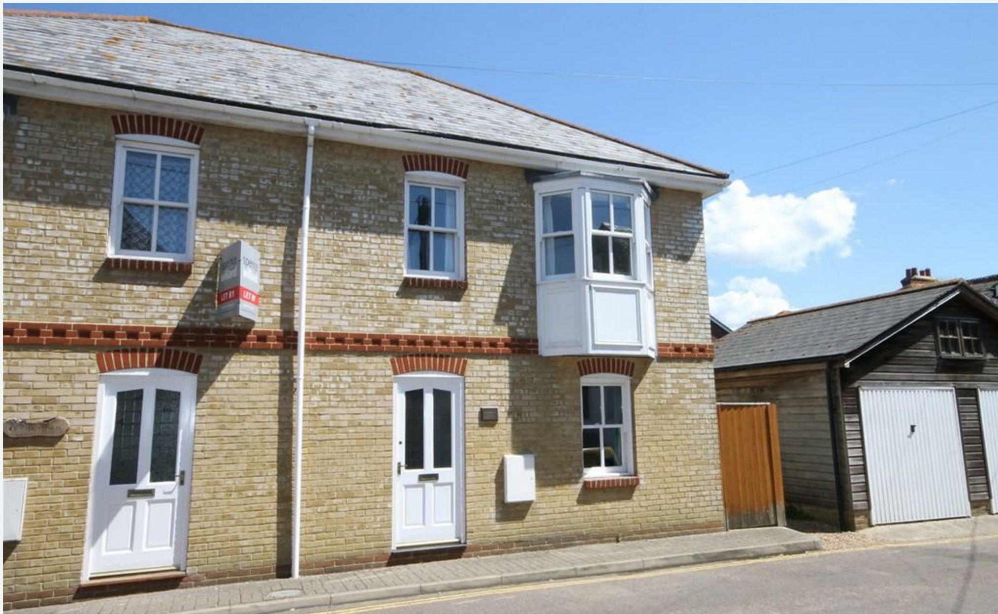
Uvedale House, Yarmouth, Isle of Wight