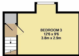
2ND FLOOR APPROX. FLOOR AREA 196 SQ.FT. (18.2 SQ.M.)

TOTAL APPROX. FLOOR AREA 1025 SQ.FT. (95.2 SQ.M.) Whilst every attempt has been made to ensure the accuracy of the floor plan contained here, measurements of doors, windows, rooms and any other items are approximate and no responsibility is taken for any error, omission, or mis-statement. This plan is for illustrative purposes only and should be used as such by any prospective purchaser. The services, systems and appliances shown have not been tested and no guarantee as to their operability or efficiency can be given. Made with Metropix ©2019