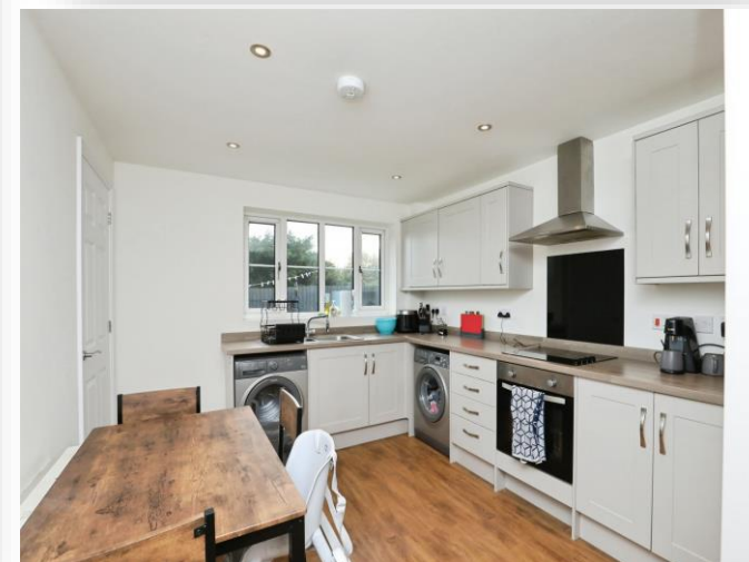
Burghwood Drive, Mileham King's Lynn PE32 2QU