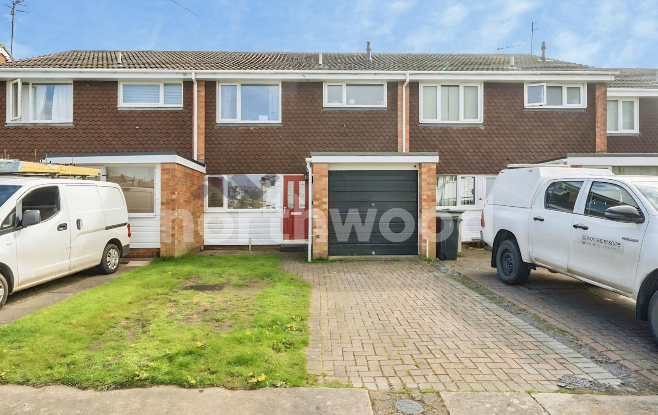
Chalfont Close, Northwick, Worcester