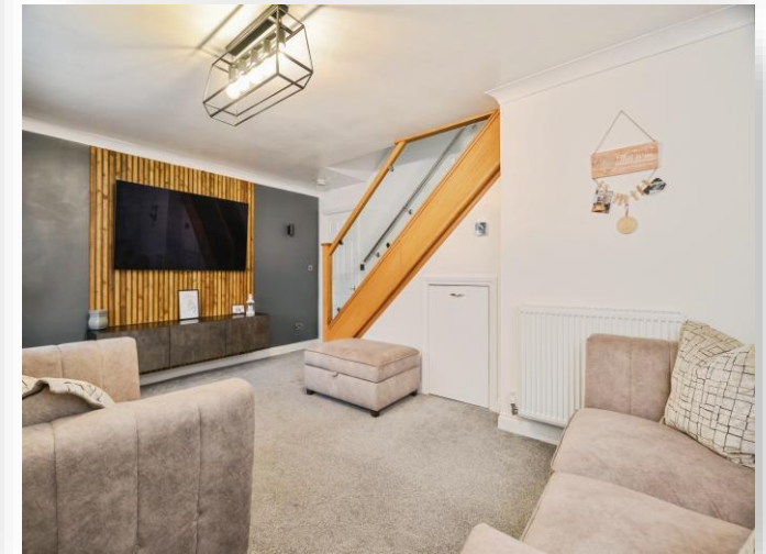
Redland Close, STOCKTON-ON-TEES TS18 5PY