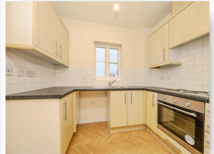
Alnesbourn Crescent, Ipswich, IP3 9GD