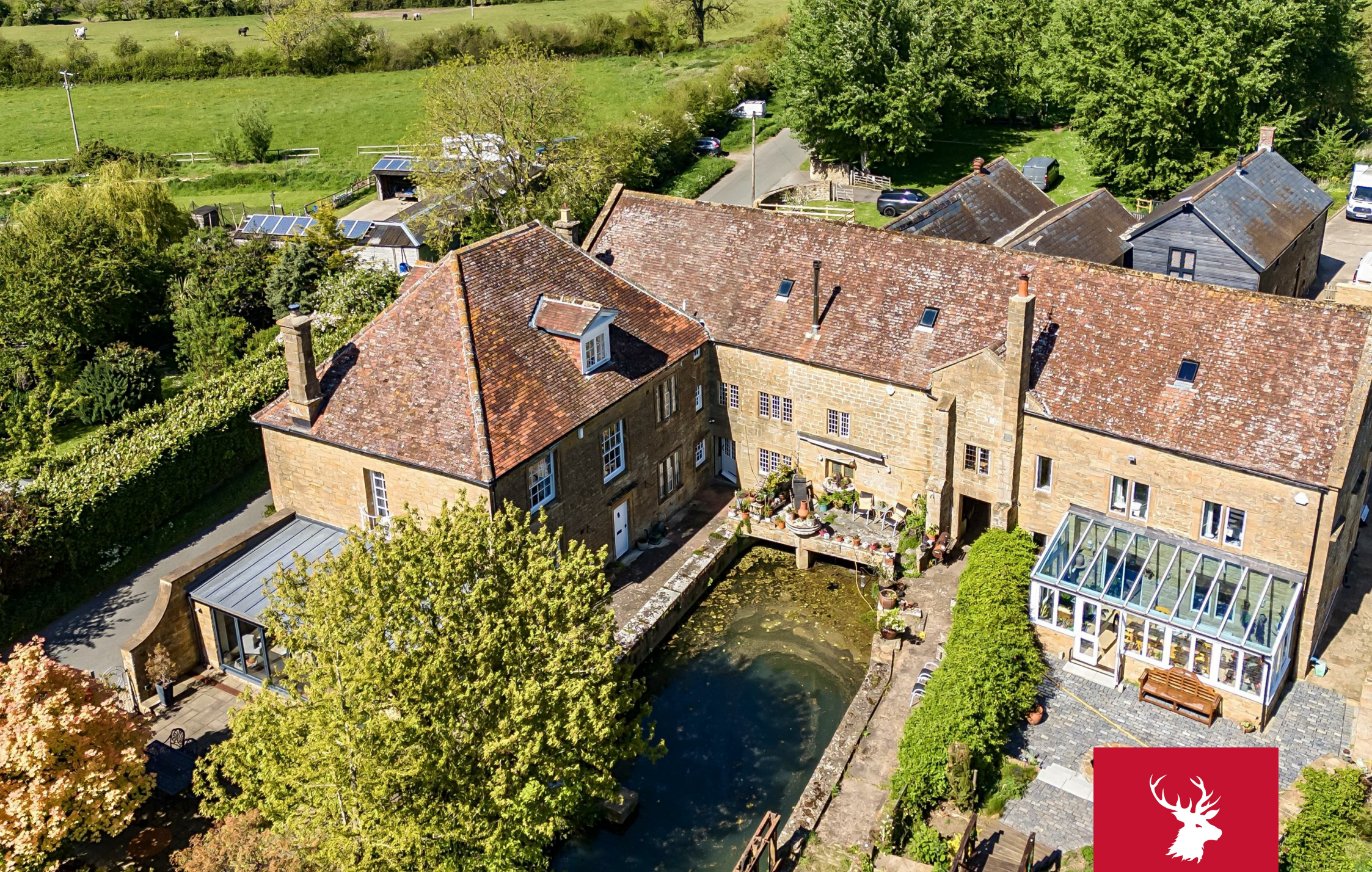
The Wheelhouse, Gawbridge Mill