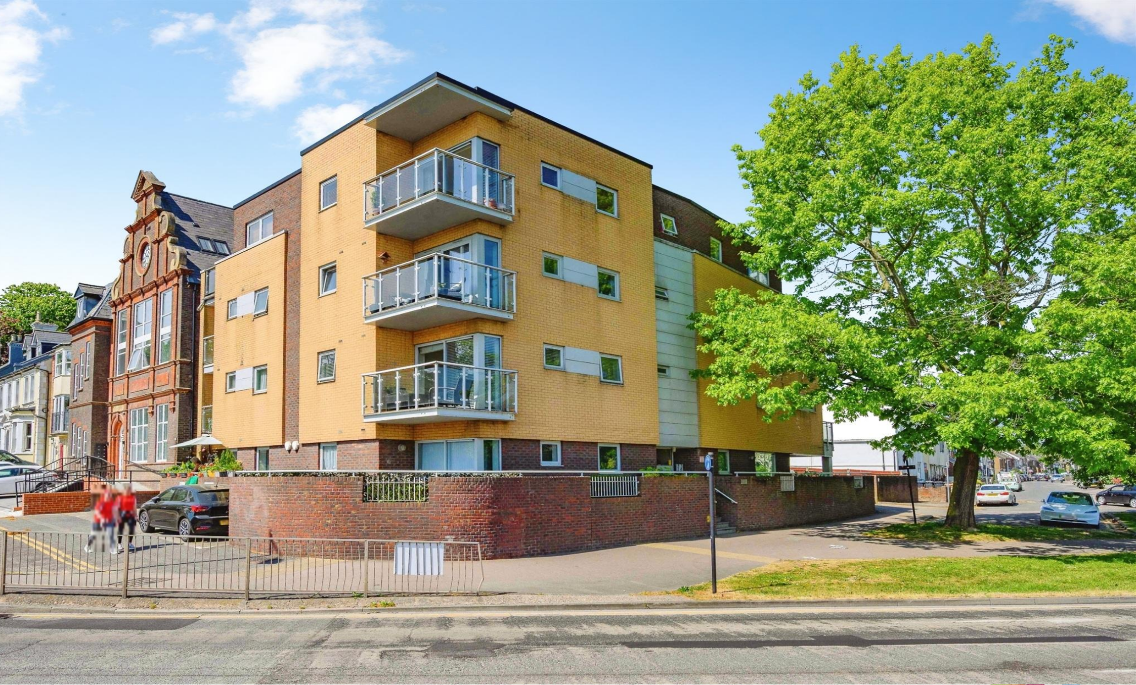
Heath Park House Cottrells, HEMEL HEMPSTEAD HP1 1HZ