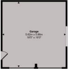
Garage Approx 33 sq m / 354 sq ft